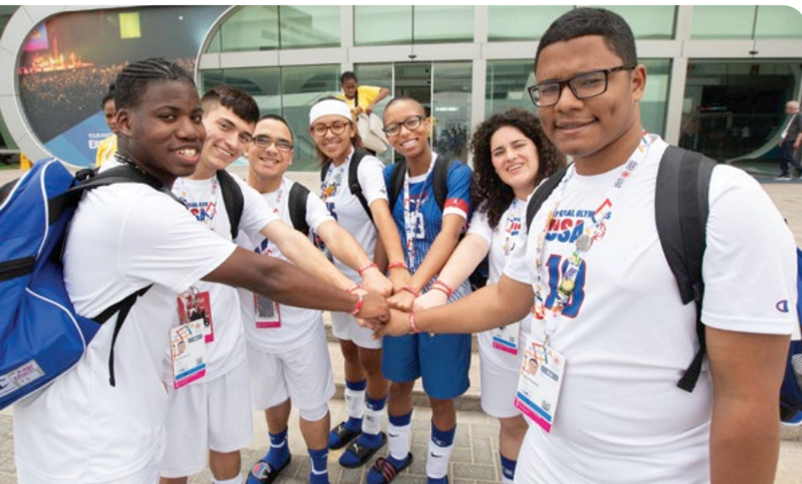
Left: The Community and Legacy Committee sought to engage with 100,000 youth through the Special Olympics by working in partnership with education organisations

the rights for differently abled people, promoting the integration and inclusion of people with different needs in the society. Choosing Abu Dhabi as the host city was therefore the right choice and enables the emirate to build a profound and lasting impact for the movement itself, for the cause it has been advocating, and for its flagship sporting events.”